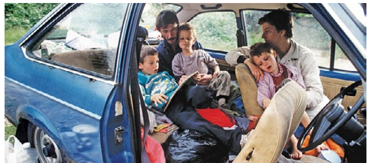
More and more homeless families are living in their vehicles.

More than 80 million people voted for change on Election Day 2020. Their demands must be heeded!