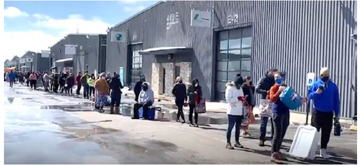
Food line in Austin, Texas, after the storm.

"Officials said 33 prisons lost power and 20 had water shortages after the state's electrical grid failed for several days during single-digit temperatures. Though the Texas Department of Criminal Justice said generators kept electricity on, staff, prisoners and their families reported frigid—and increasingly horrific—conditions around the system.