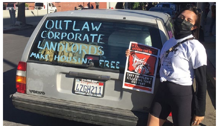
A participant in the freedom ride for housing in Los Angeles where people are dying daily due to a lack of housing and the pandemic.

General Dogon: "We're freedom riding for housing. We're freedom riding to end the dirty divide in the city of Los Angeles. When you look around the city you can see the public