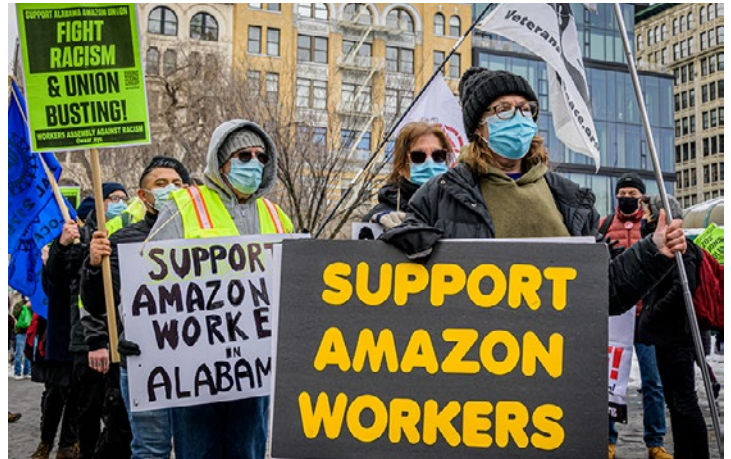
New Yorkers show their solidarity with Amazon workers in Alabama. Support is growing nationally for the workers right to organize.