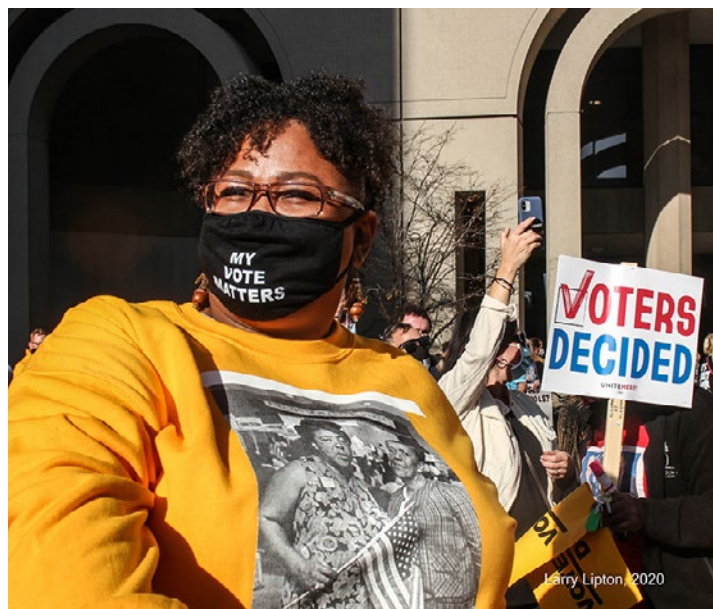
Detroit celebration of Trump's presidential defeat.

What can we, the people, do? First, we should recognize that the far right is a serious threat and needs to be crushed, at the polls and by government. But we should also see that fascism