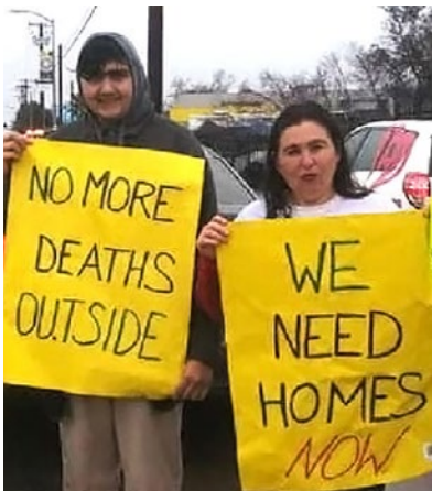
Pressure from below must continue.

The final version of the bill will contain some relief for the many who are suffering — but not enough. The millions who used the ballot as a weapon to advance their interests will have to keep the pressure up even after the stimulus package is signed into law.