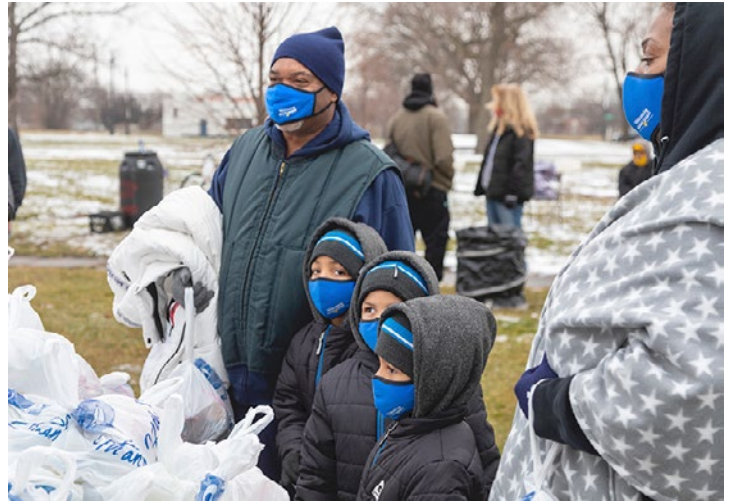
Family at food give-away in Michigan, where joblessness is growing.