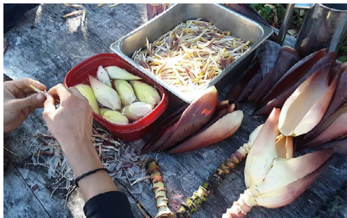
Banana flower processing and harvest at Ndn Bayou Food Forest in South Louisiana.

Over 400 fruit trees have been propagated and will be cared for until they're ready to be planted later this year. These and a diversity of other fruit, nut and native wetland trees are being gifted to neighbors and gardeners locally, and in neighborhoods throughout New Orleans via a partnership with the Lobelia Commons' food autonomy initiative. These gifts are often accompanied by public demonstrations and skill-shares.