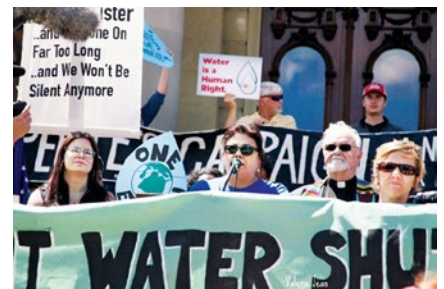
Detroiters fighting to stop immoral water shut-offs prior to the pandemic.

Please contact us for more information or to contribute ideas at info@peopletribune.org