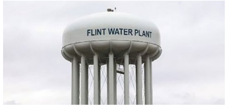
The people of Flint are still struggling for justice.

Also, the property damage max of $1,000 for Flint homeowners is woefully inadequate as this amount does not consider (1) the exorbitant utility rates for unusable water that Flint citizens were expected to pay during the Water Crisis, the tainted water, and (2) the other costs incurred because of the tainted water: